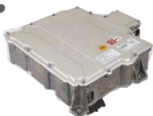
2019 Audi e-tron