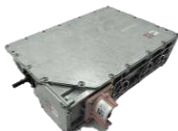
2019 Jaguar I-PACE