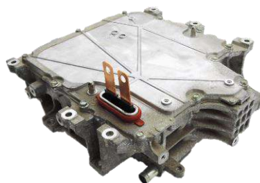
2019 Nissan Leaf