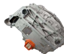
2020 Tesla Model Y – Front & Rear