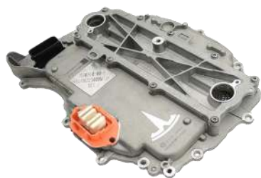
2018 Tesla Model 3